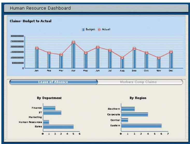
Figure 3: Overview of Visual Models of Benefits

Sage Crystal Dashboard Design is based on Microsoft Windows®. It is designed to create data presentations based on Adobe Flash and to build dashboards from Microsoft Excel spreadsheets and a single live data source. It offers a feature-rich library of ready-to-use charts, maps, gauges, progress bars, and more for creating interactive and engaging data visualizations. Its point-and-click interface lets you quickly connect prebuilt charts and graphics to personal data in spreadsheets or live company data through an XML data feed or web service. You can then deliver the charts and graphics live as part of Microsoft Office, Adobe PDF, Adobe SWF, Adobe AIR, and the web (Figure 3).