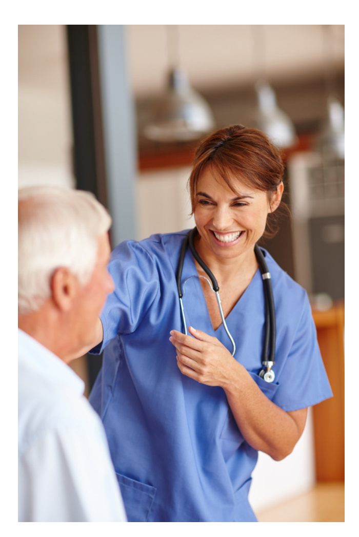
Nisbet Lodge expects that through its partnership with BAASS and the capabilities of Sage Intacct, it will ultimately be able to automate 99% of its manual processes.